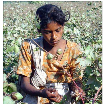
Child exploitation and slavery is something we are raising people's awareness about.

'Pray for the Lord of the harvest to send out workers into His harvest fields'